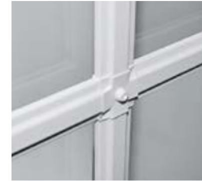
Georgian Bars - Internal