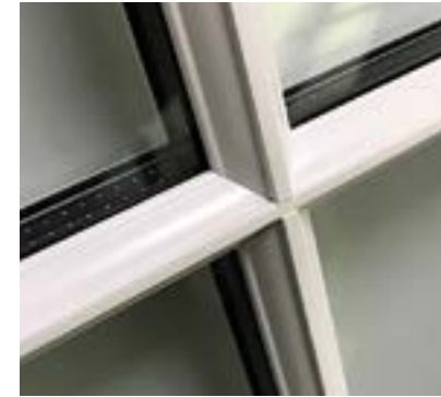
Astragal Bars - External

Complete your sash windows with our range of stunning hardware finishes! From classic white to sleek chrome or timeless antique gold, choose the perfect style to match your home's aesthetic.